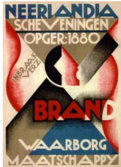
Poster by J.H. Albarada, 1929

info@degroepvandelft.nl , www.degroepvandelft.nl